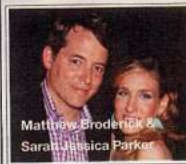
Matthew Broderick & Sarah Jessica Parker

PACK Bebel Gilberto's sexy self-titled bossa nova CD